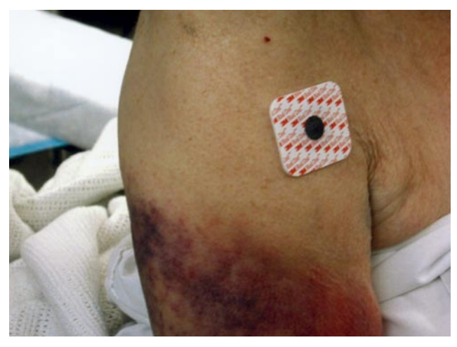
Figure 1. The arm was tense and painful posteriorly.

On physical examination, her vital signs were all normal, with the exception of a systolic blood pressure of 147 mm Hg and a diastolic pressure of 82 mm Hg. She held her arm in 90° of elbow flexion. Ecchymosis extended over the entire posterior upper arm and anterolateral forearm. The posterior compartment of the arm was firm, swollen, and painful to palpation (Figure 1). The anterior arm was less tense and not as painful. She had no active elbow extension, wrist