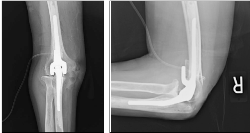
Figure 5A (left) and B (right). Postoperative radiographs of the right elbow in a patient after total elbow arthroplasty for endstage rheumatoid arthritis.

quently, the risk of failure of total elbow arthroplasty is higher and the survivorship lower when compared to patients with rheumatoid arthritis, and alternative treatments should be considered prior to considering joint replacement.