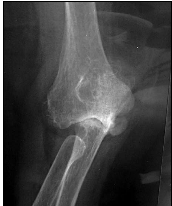
Figure 2. Anteroposterior radiograph of the right elbow in a patient with Grade IV rheumatoid arthritis.