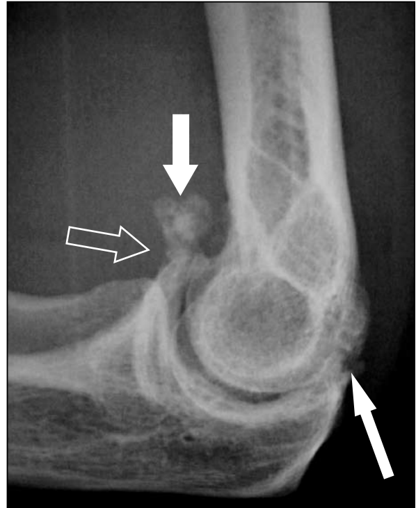
Figure 1. Lateral radiograph in a patient with elbow osteoarthritis. Osteophytes are present both on the coronoid (open arrow) and olecranon (narrow arrow) limiting both flexion and extension. There is a large loose body in the anterior joint space (filled arrow).

The extent of the radiographic findings usually correlates with the patient's symptoms. Osteophyte formation on the tip of the olecranon and in the olecranon fossa leads to pain and limitation of elbow extension, while osteophytes on the coronoid and in the coronoid and radial fossae leads to pain and limitation of elbow flexion. (Figure 1) Secondary changes include osteophytes at the margin of the radial head and loose bodies. Occasionally the radiohumeral joint is selectively involved. 6 Because of excessive osteophyte formation in the region of the cubital tunnel ulnar nerve irritation is observed in at least ten percent of these patients. CT